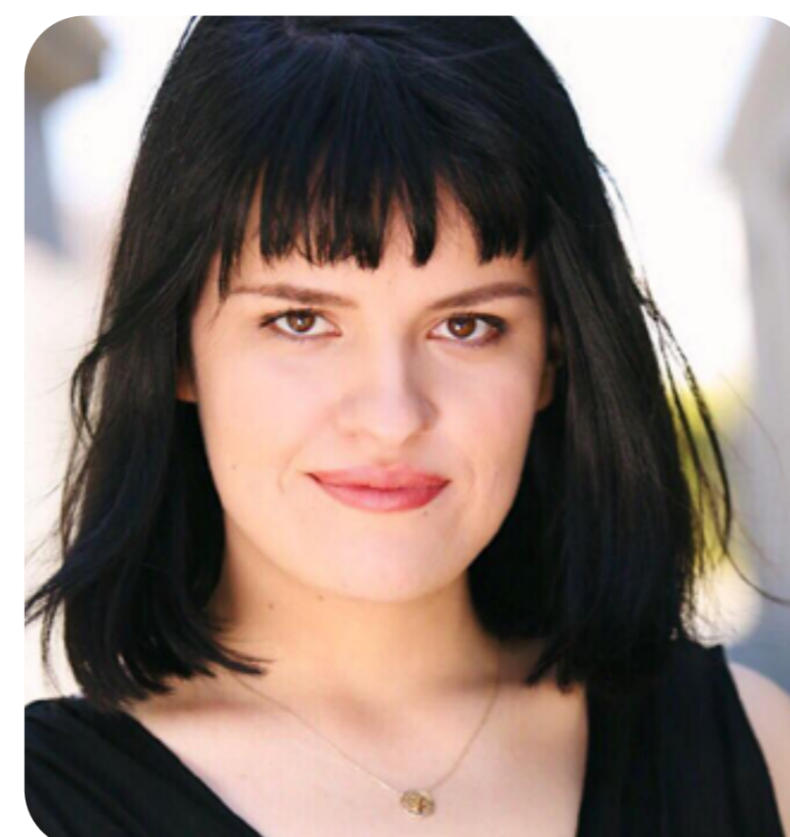
as Masha Mirova / Roulette